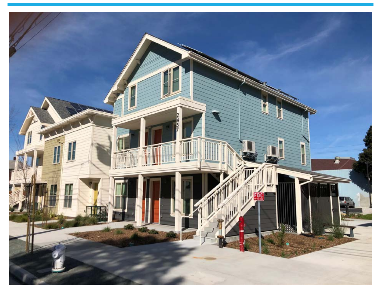
In 2018, the Alameda Housing Authority opened 20 new townhome units for very- low and low-income households on Eagle Avenue, near Park Street. The project is the result of a partnership between the Alameda Housing Authority, the City of Alameda, and the Alameda Unified School District, which provided the land.

Government Code Section 65400 requires the City to annually consider the prior year's progress meeting the City of Alameda's regional housing needs allocations (RHNA).