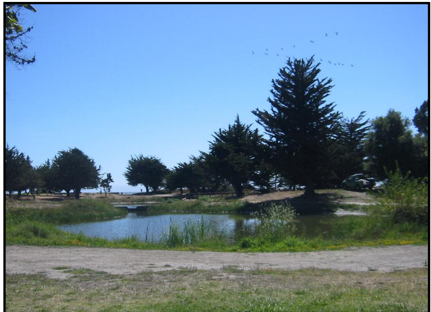
Alameda beach and waterfront

Most of the Estuary waterfront not devoted to industrial use is developed as marinas which block vistas. The proposed Estuary Park will be on the most prominent viewpoint.