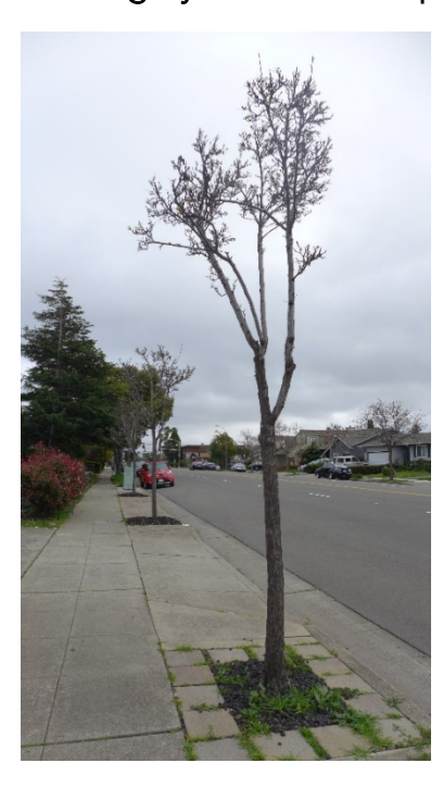
Example of existing Pyrus tree to be removed and replaced