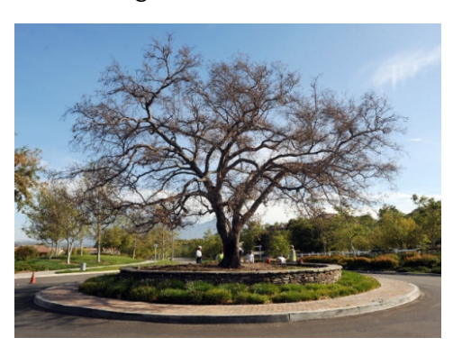
Example of Quercus agrifolia (in winter) in a roundabout