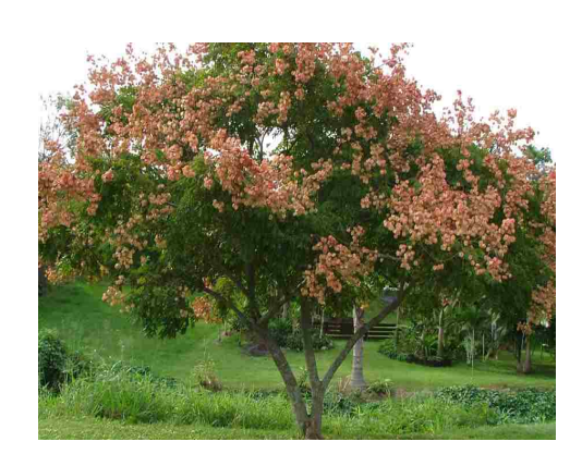
Koelreuteria elegans ssp. formosana