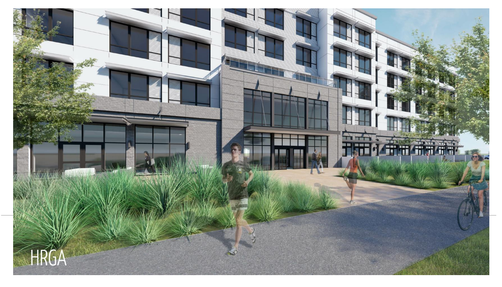
Marriott Hotel at 2900 Harbor Bay Parkway: Appeal