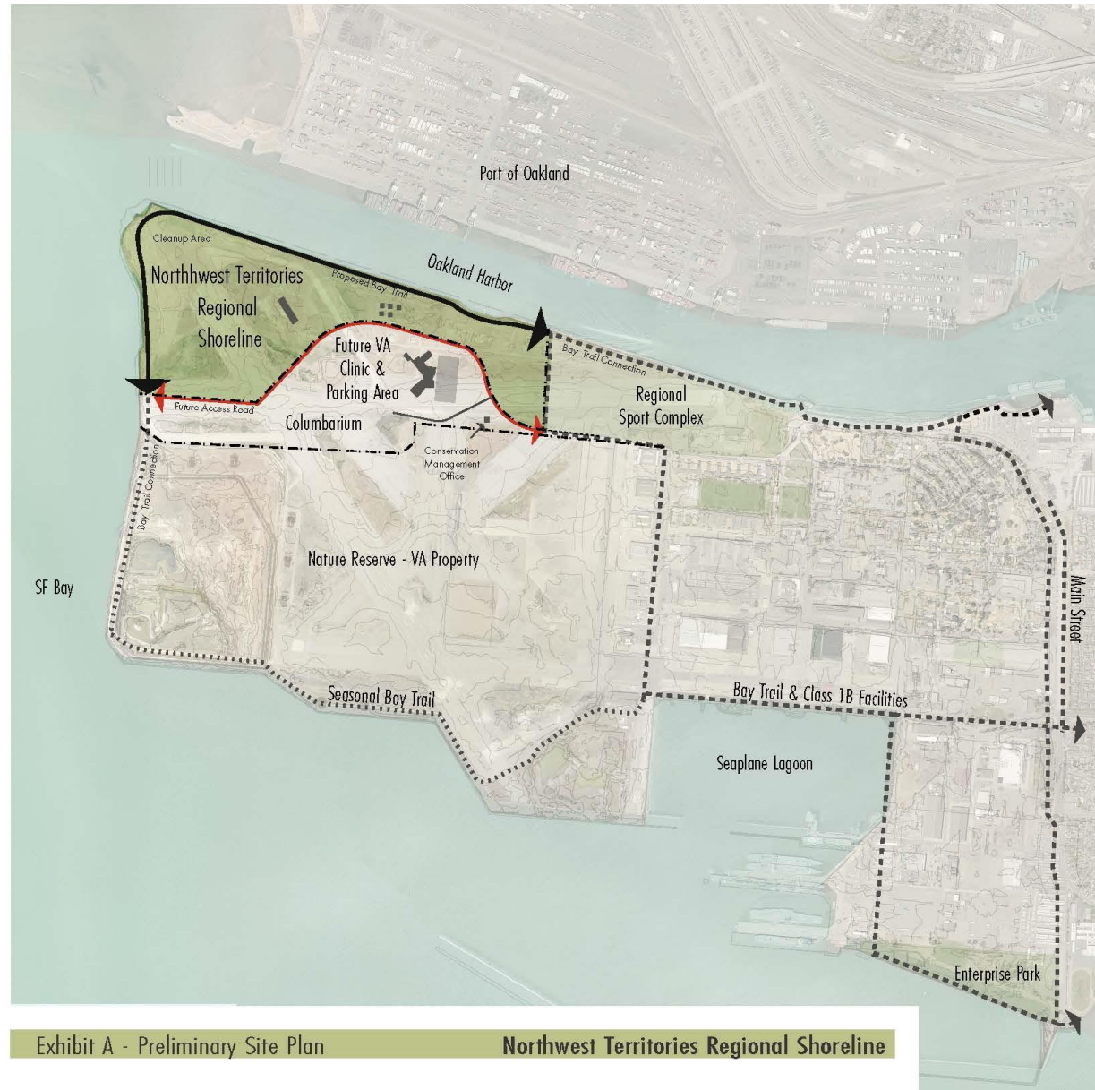
Exhibit A - Preliminary Site Plan