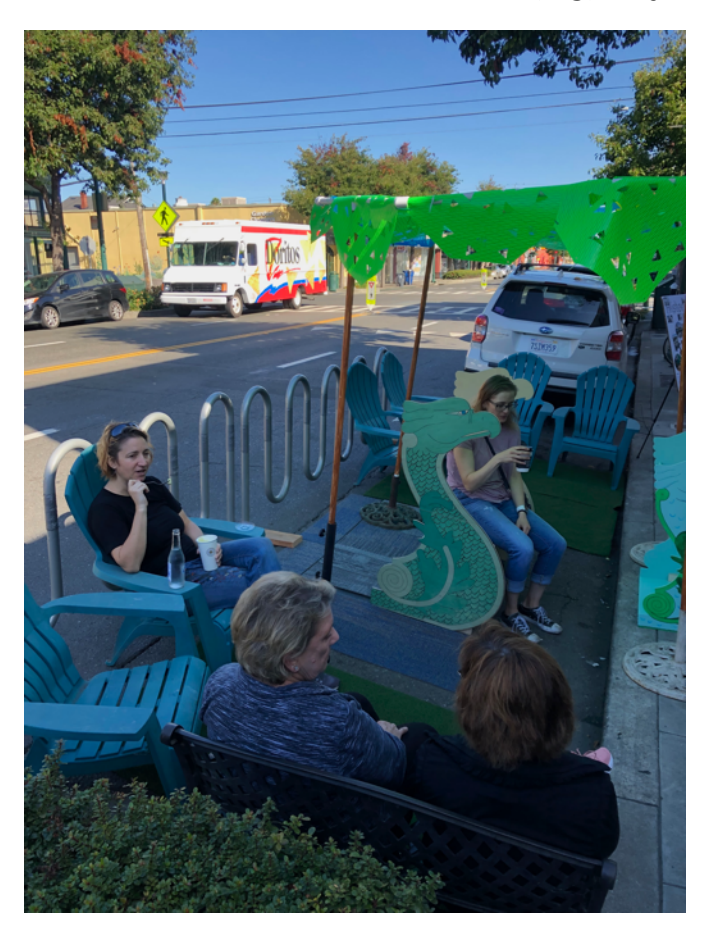
Park(ing) Day - September 2019