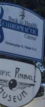
"Gottlieb's Astro" Pinball Mural Sketch Dan Fontes 12-17