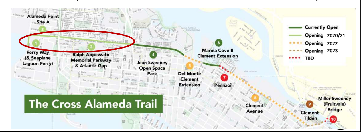
In 2020, completed between Alameda Point and Jean Sweeney Park