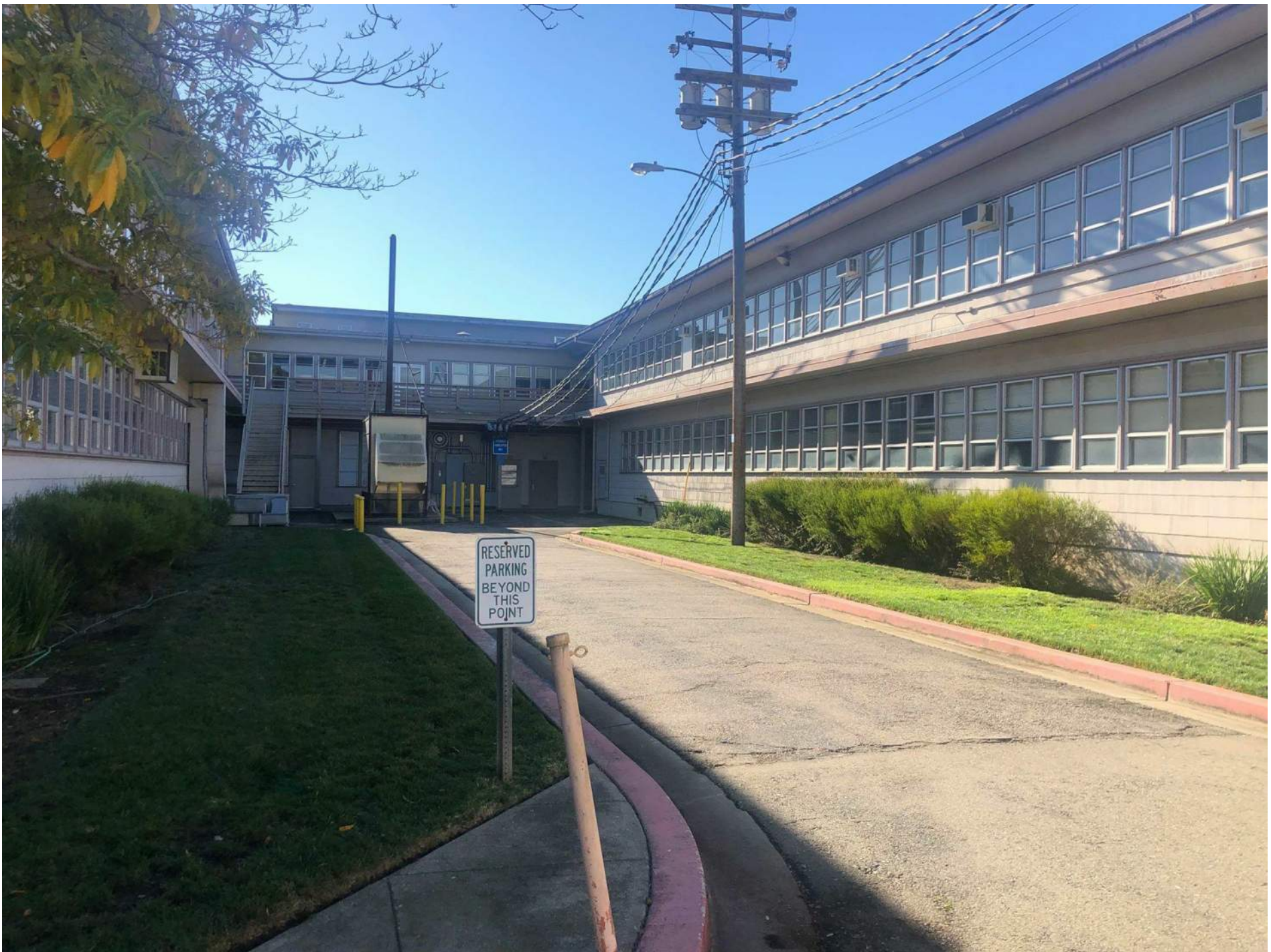
VIEW FROM SITE SOUTH TO COURTYARD OF SENIOR HOUSING BUILDING