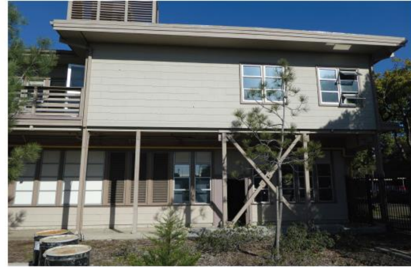
EXISTING BUILDING CONDITIONS