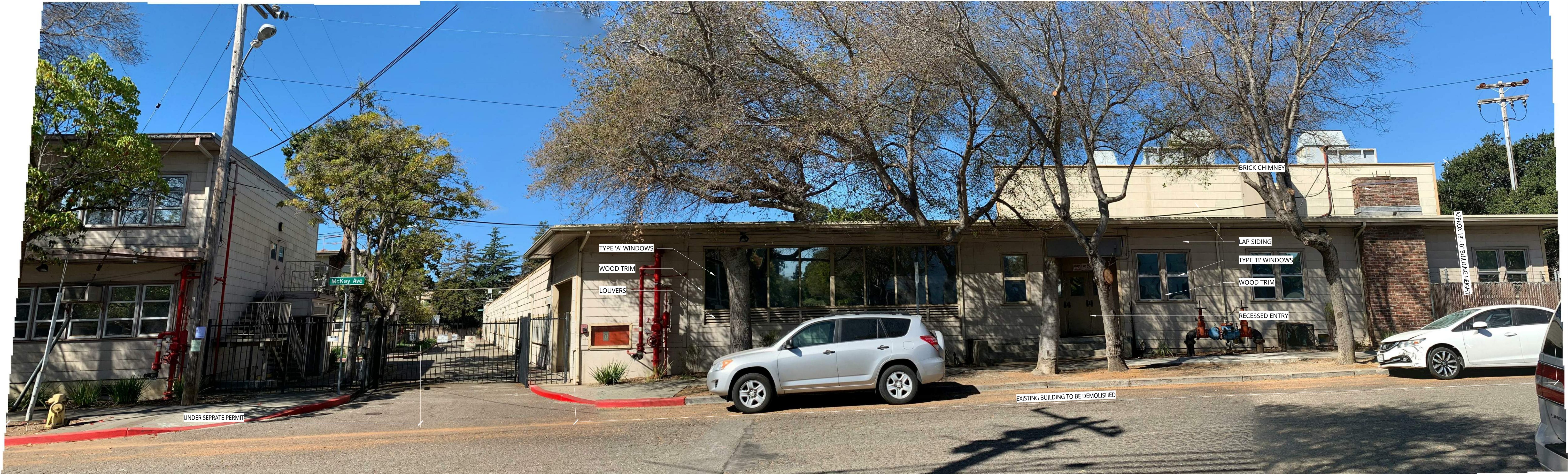
EXISTING EAST ELEVATION PHOTO COLLAGE