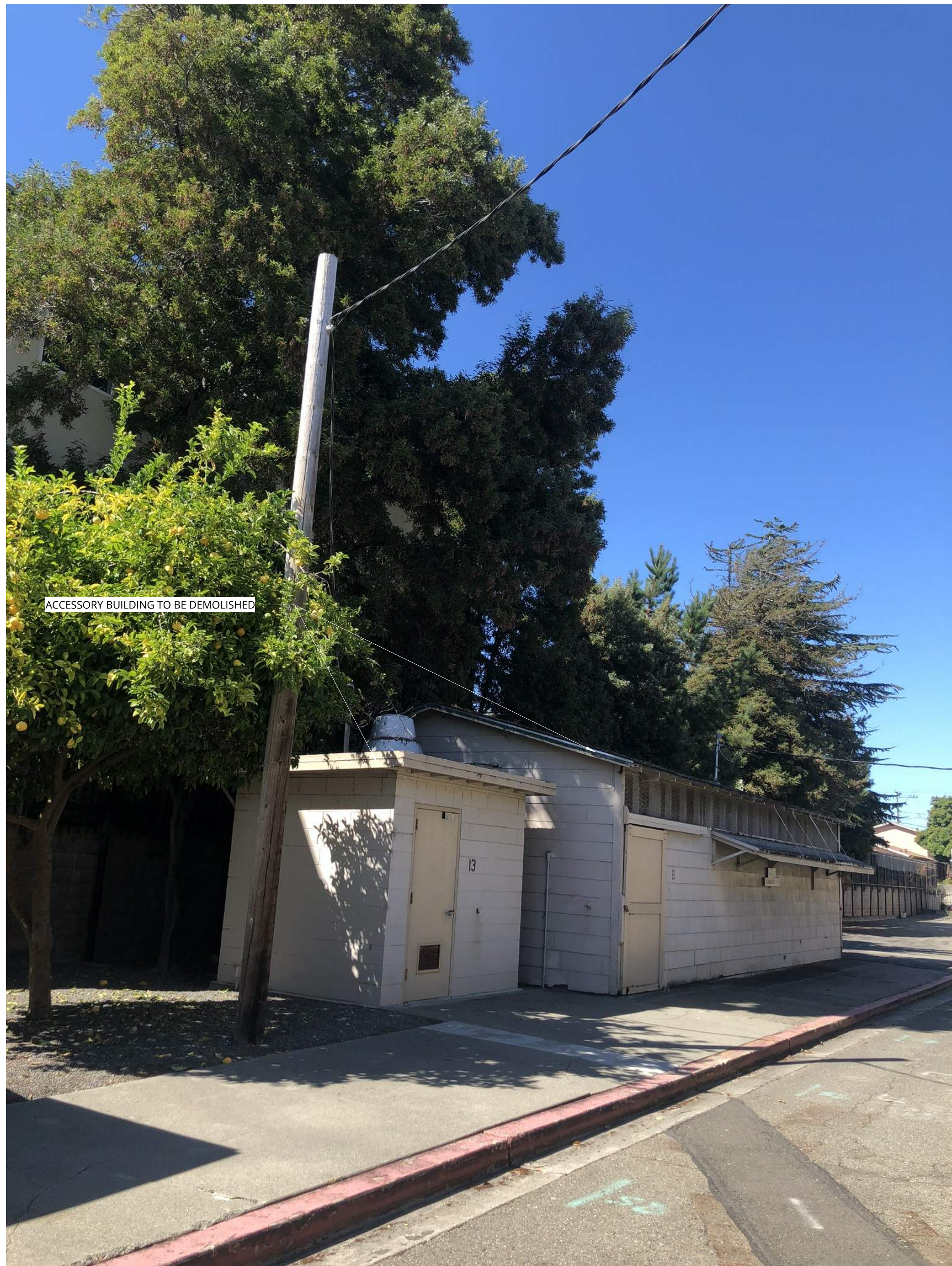
VIEW WESTERN SIDE OF EXISTING SENIOR LIVING BUILDING LOOKING NORTHWEST TOWARD ACCESSORY BUILDINGS ALONG WESTERN PROPERTY LINE