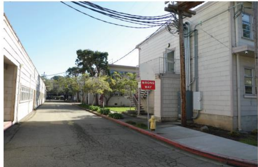
EXISTING BUILDING CONDITIONS