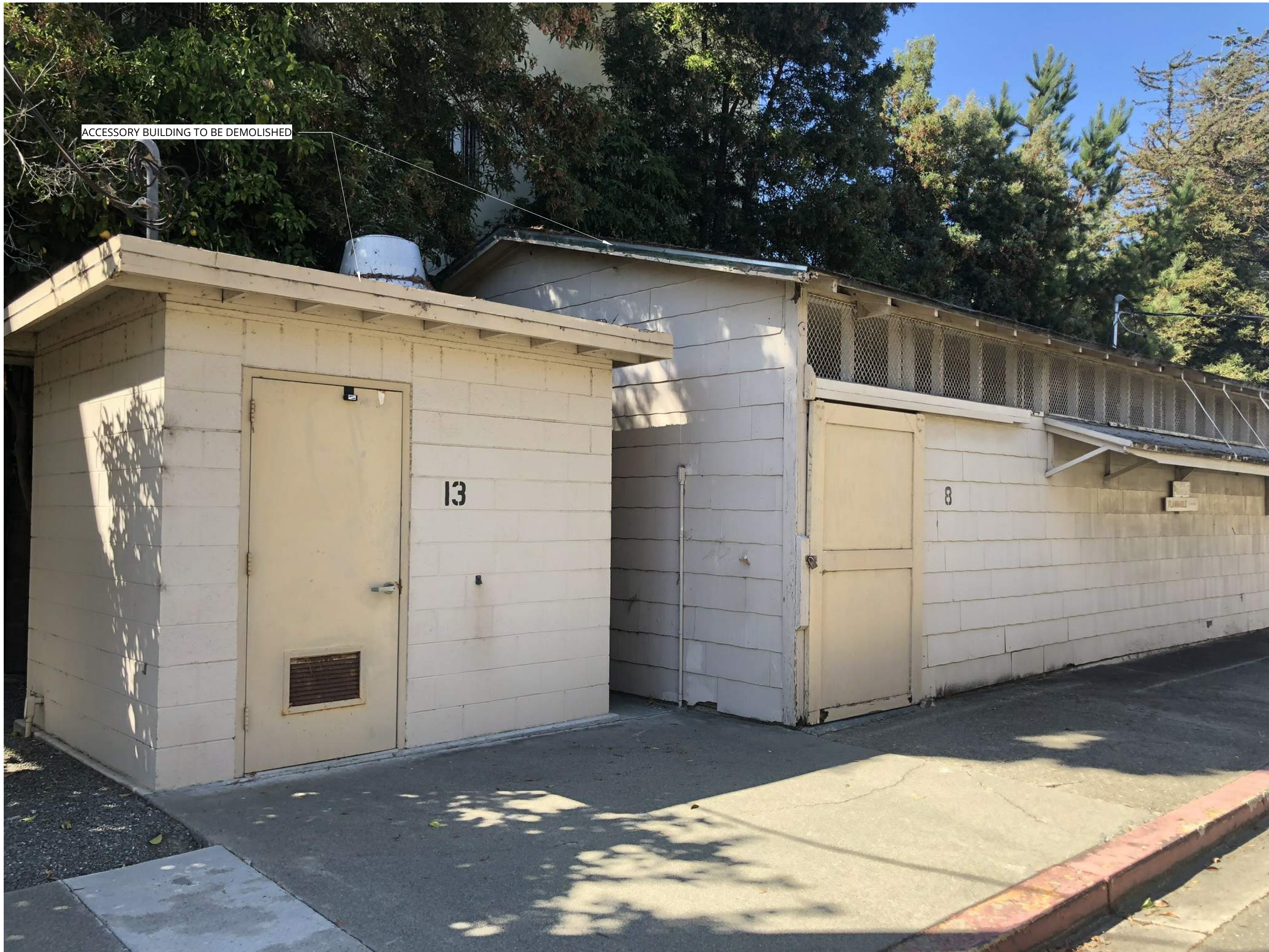
VIEW WESTERN SIDE OF EXISTING SENIOR LIVING BUILDING LOOKING NORTHWEST TOWARD ACCESSORY BUILDINGS ALONG WESTERN PROPERTY LINE