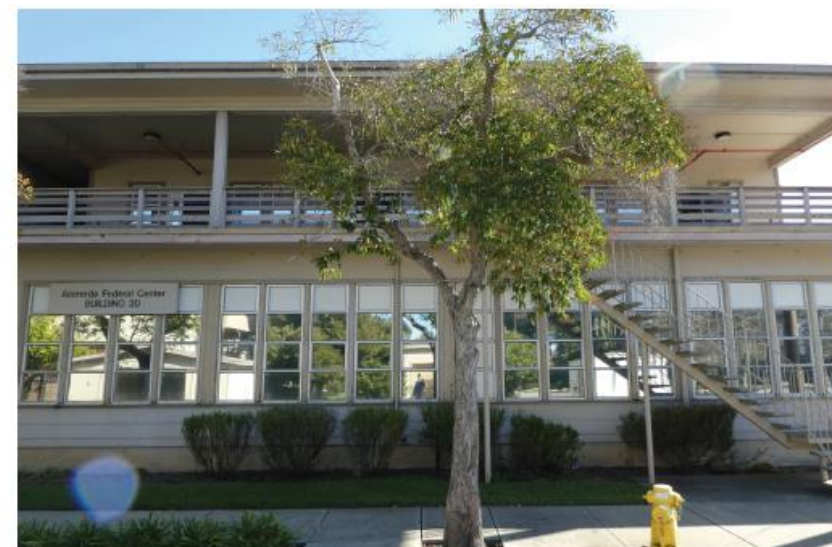
EXISTING BUILDING CONDITIONS