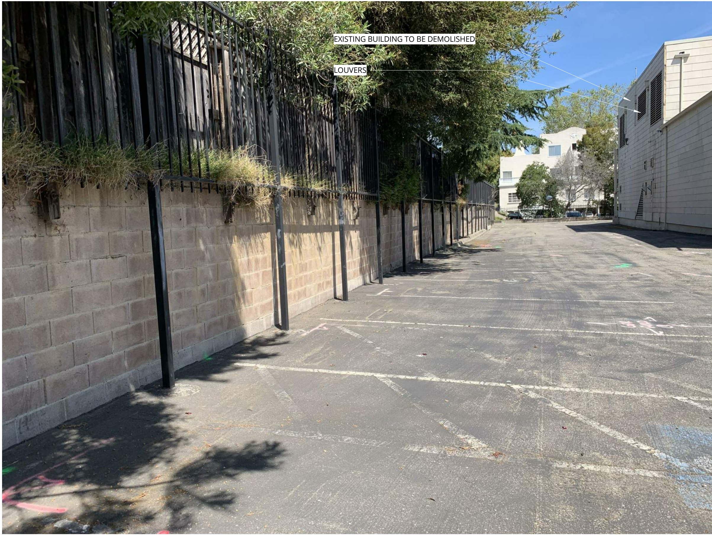
EXISTING BUILDING TO WEST PROPERTY LINE PHOTO