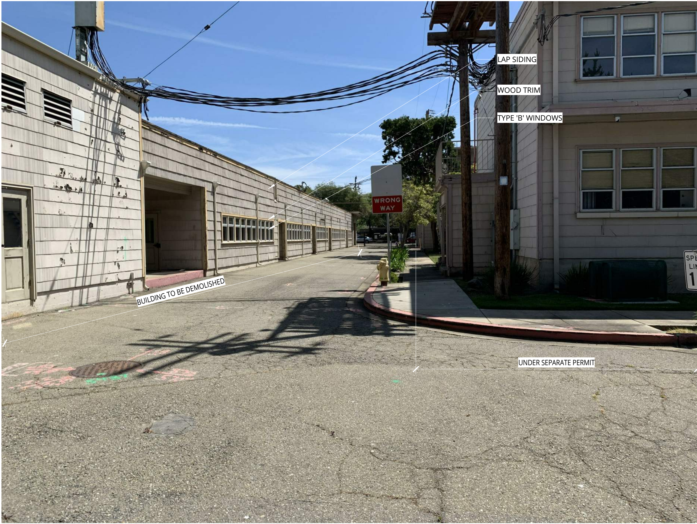
EXISTING SOUTH ELEVATION PHOTO