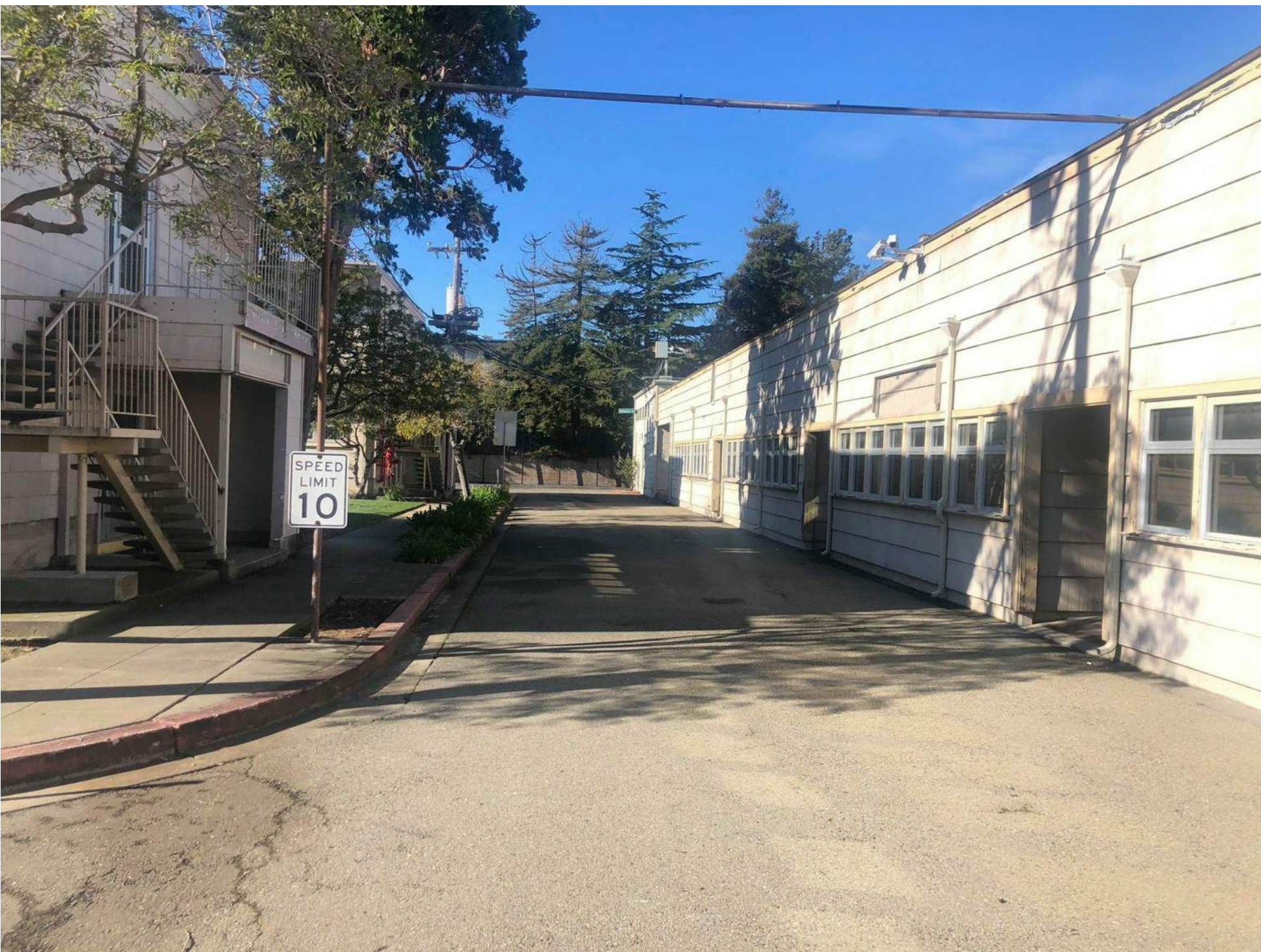
VIEW LOOKING WEST BETWEEN SENIOR HOUSING BUILDING AND BUILDING TO BE DEMOLISHED