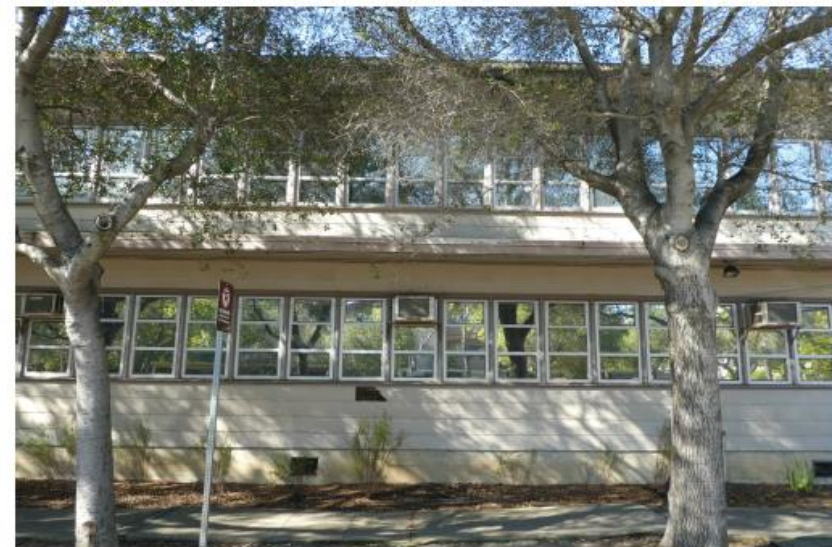
EXISTING BUILDING CONDITIONS