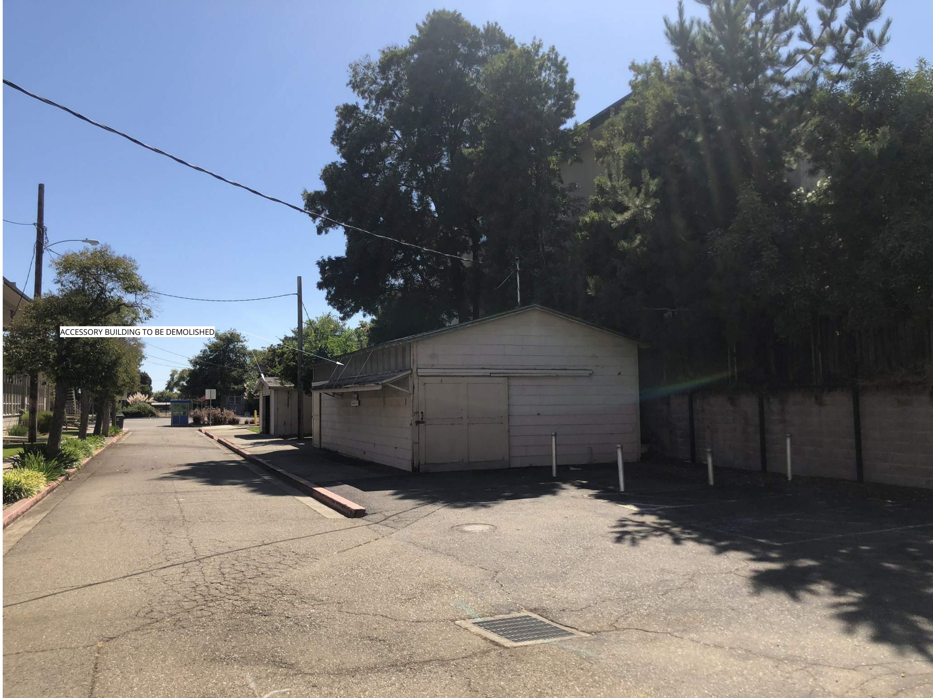
VIEW LOOKING SOUTH FROM NORTHWEST CORNER OF EXISTING SENIOR LIVING BUILDING TOWARD ACCESSORY BUILDINGS ALONG WESTERN PROPERTY LINE