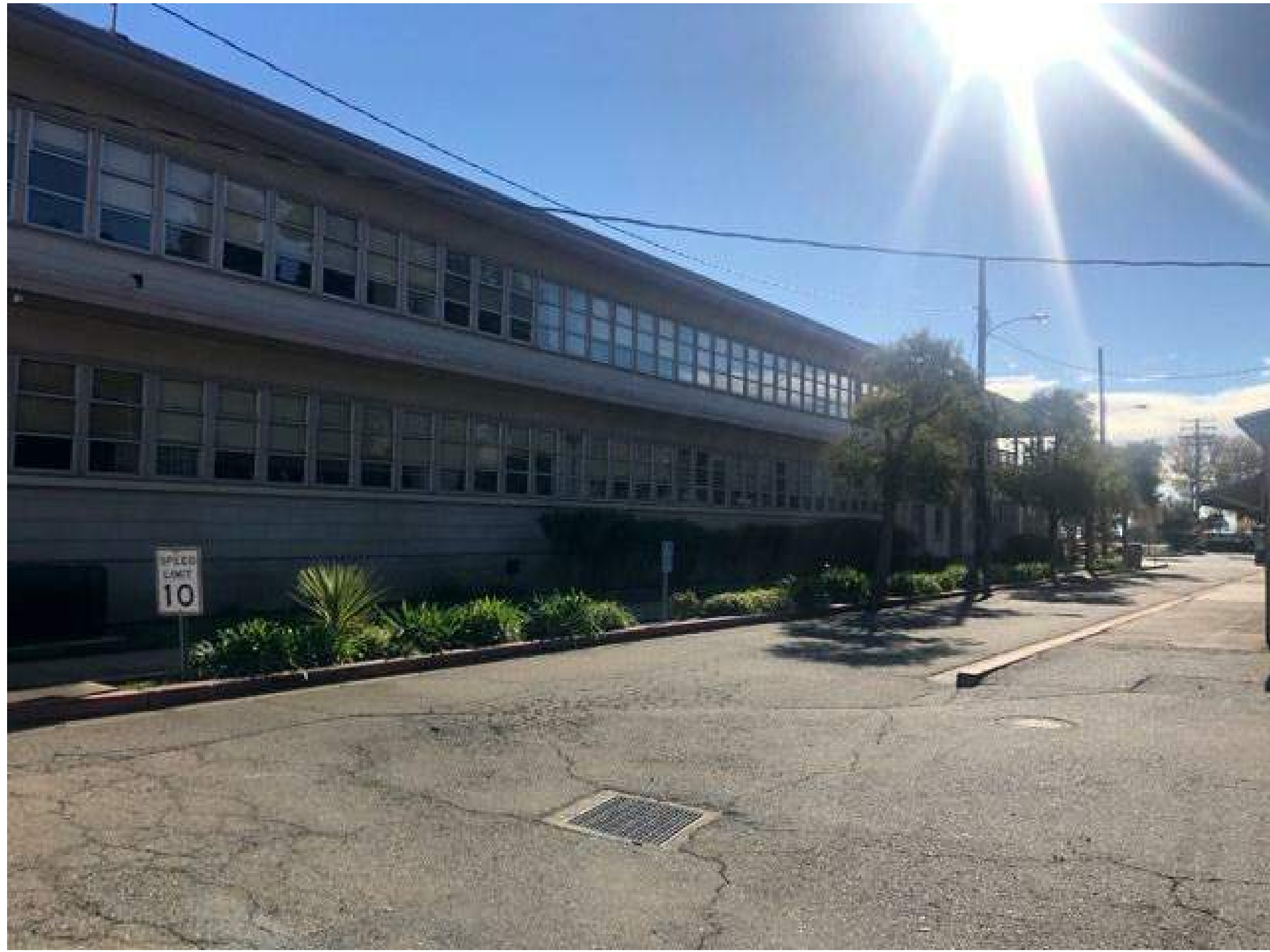
VIEW OF SENIOR HOUSING BUILDING ADJACENT TO SITE