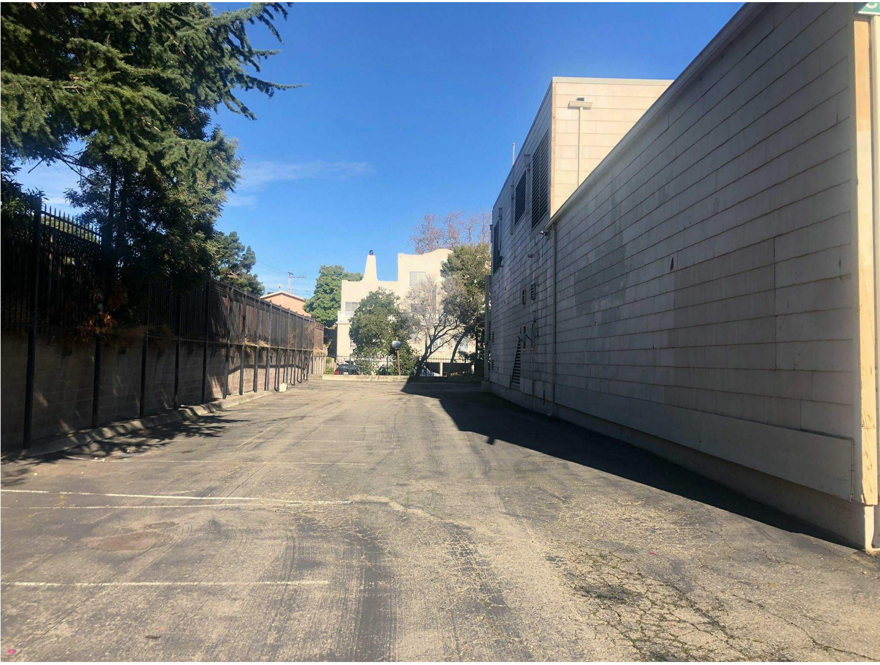
VIEW LOOKING NORTH FROM SOUTHWEST CORNER OF THE EXISTING BUILDING