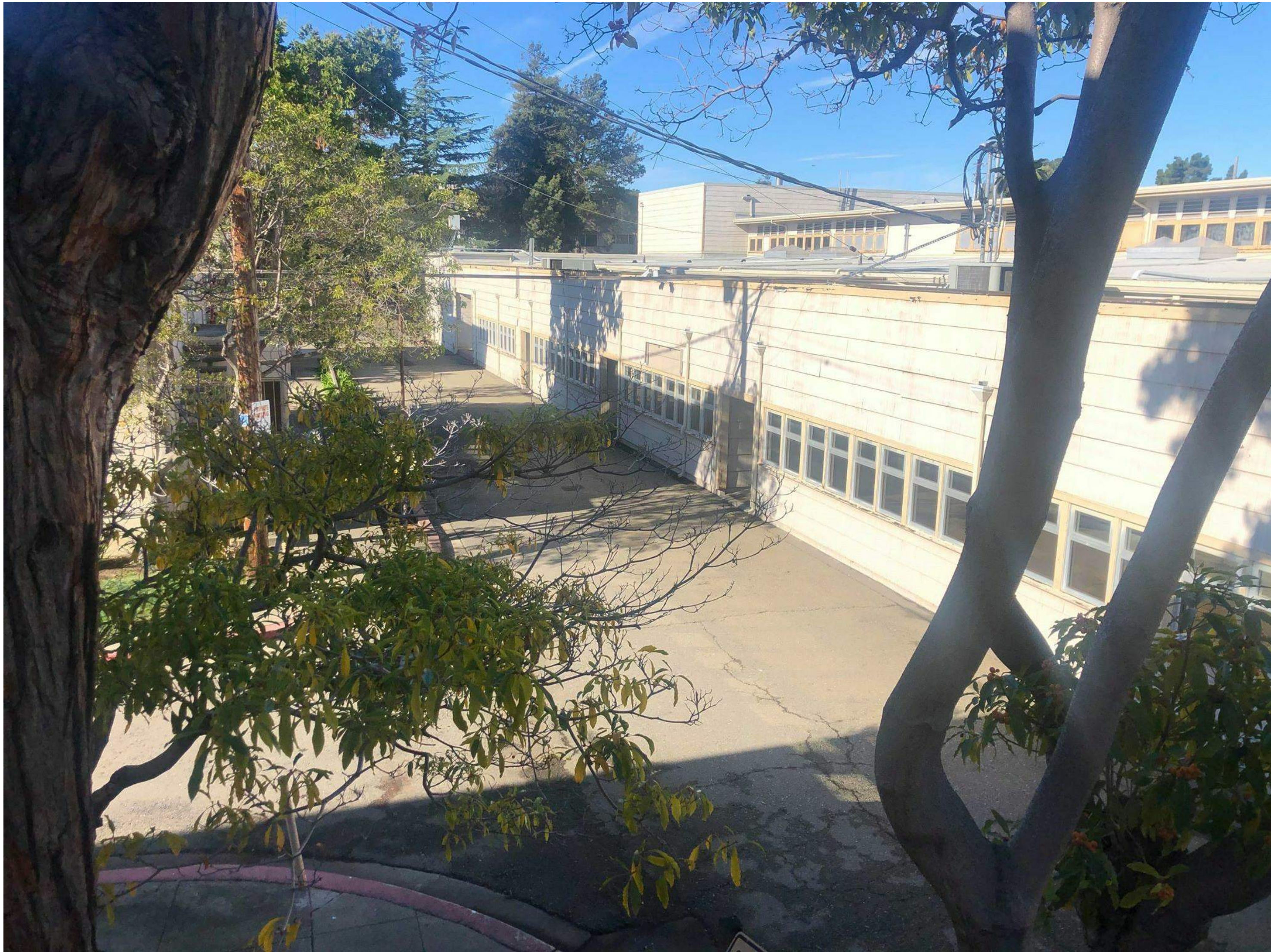
VIEW FROM SENIOR HOUSING BUILDING TO EXISTING BUILDING TO BE DEMOLISHED