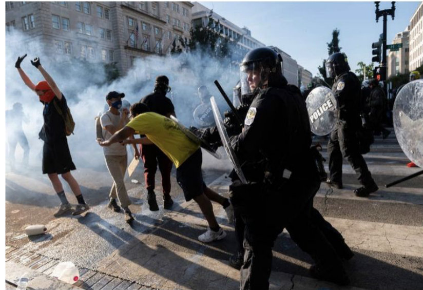
United States Park Police officers push back protesters during a Black Lives Matter demonstration near the White House, June 1, 2020.