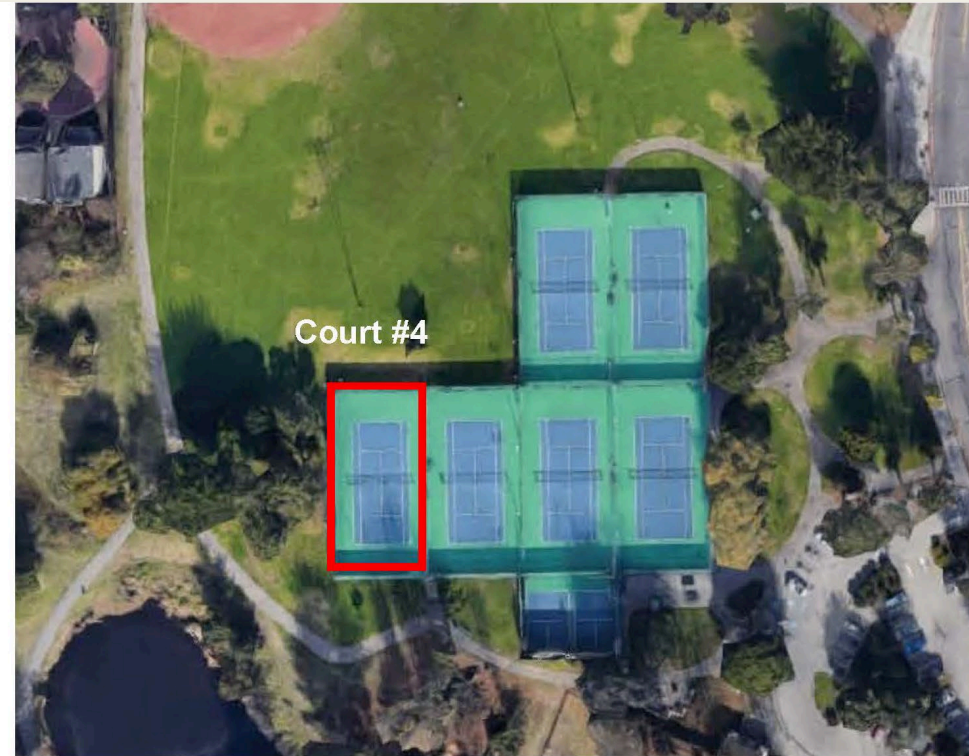
Court #4 Location