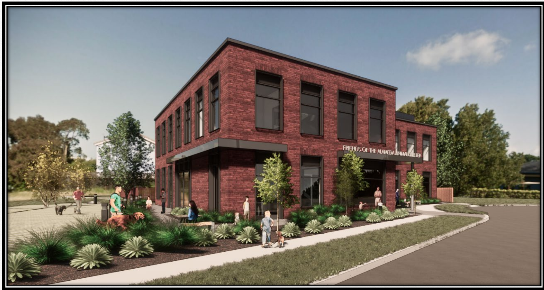
FAAS North Loop Community Center in the Harbor Bay Business Park