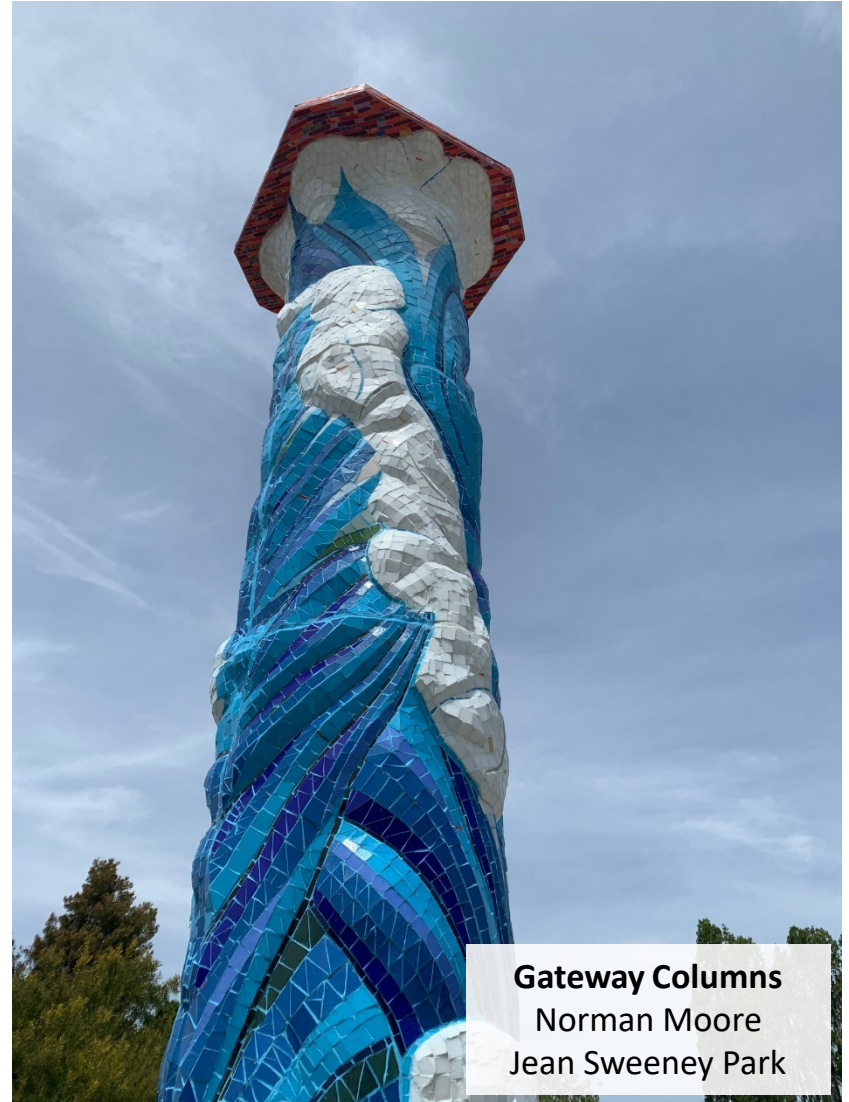
Gateway Columns Norman Moore Jean Sweeney Park