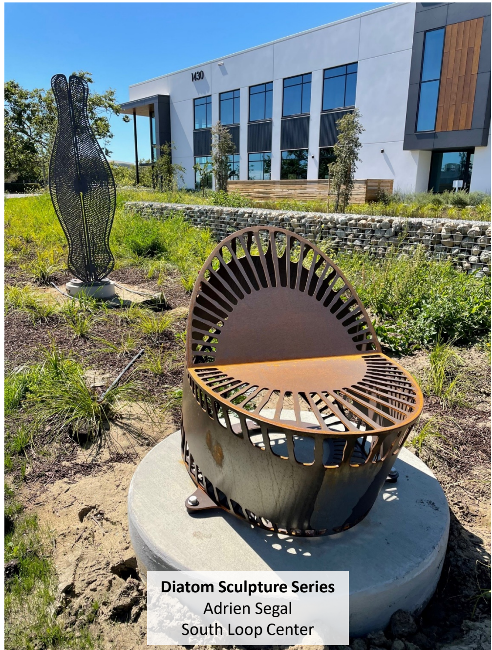
Diatom Sculpture Series Adrien Segal South Loop Center