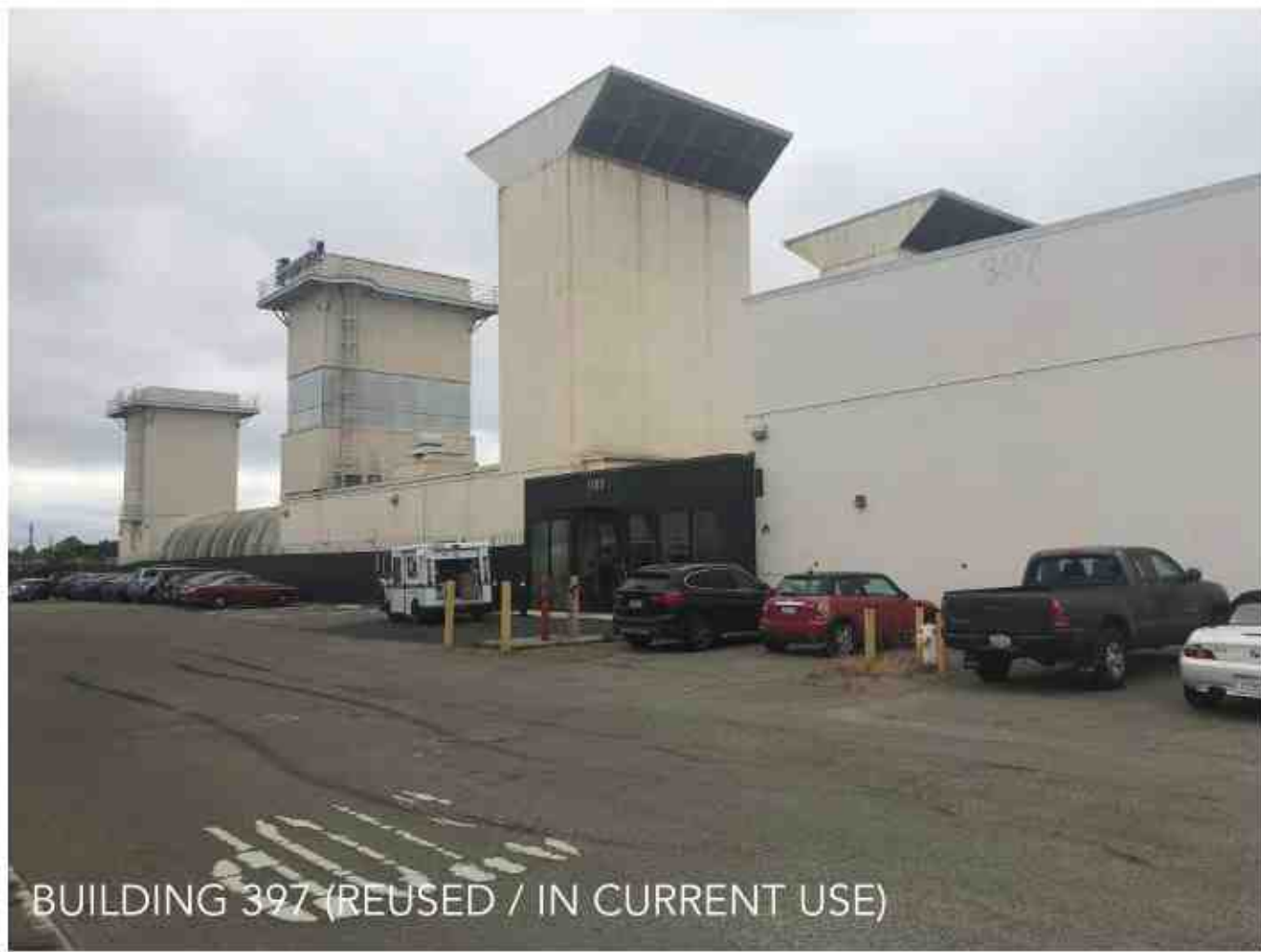
BUILDING 397 (REUSED / IN CURRENT USE)