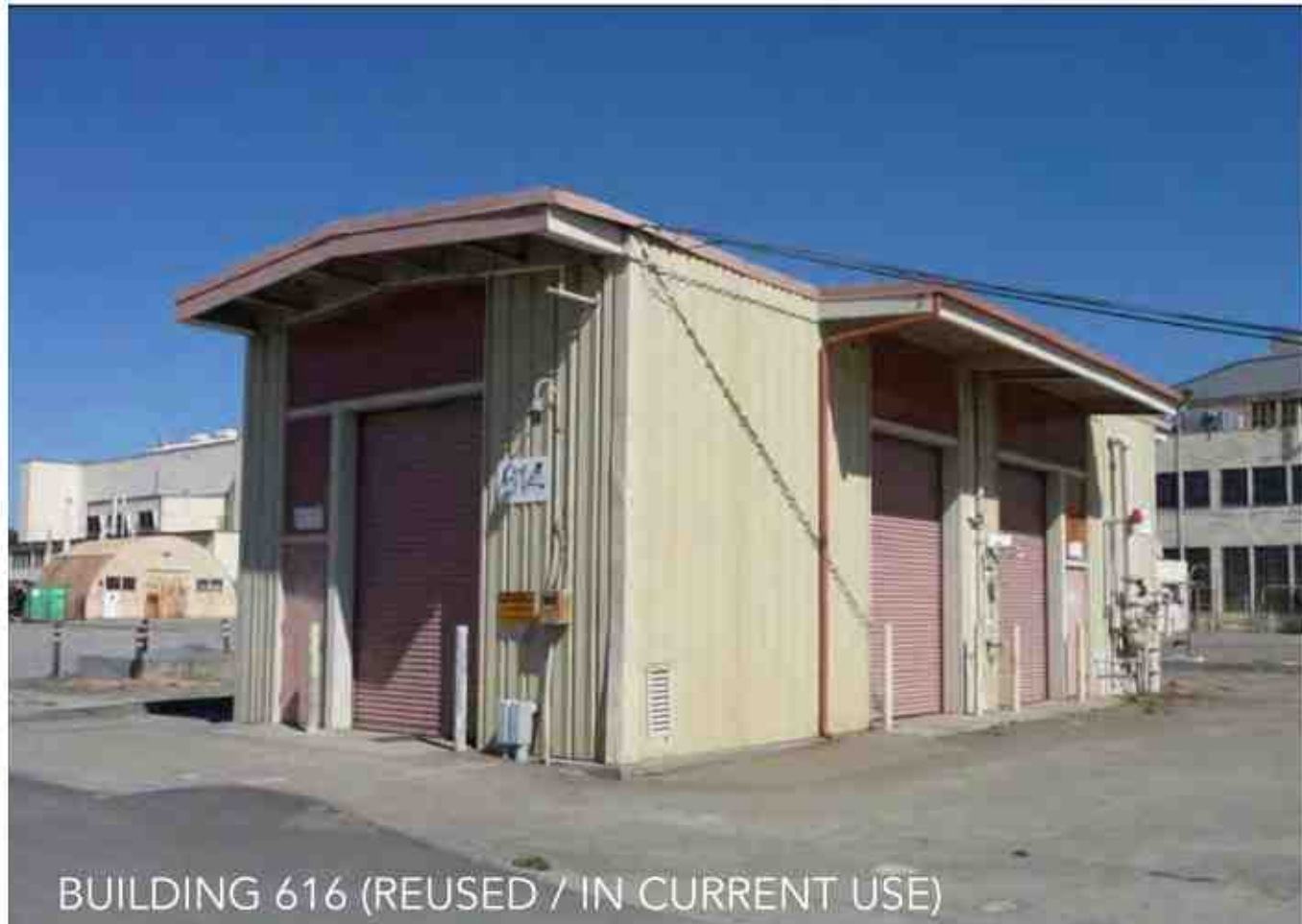
BUILDING 616 (REUSED / IN CURRENT USE)