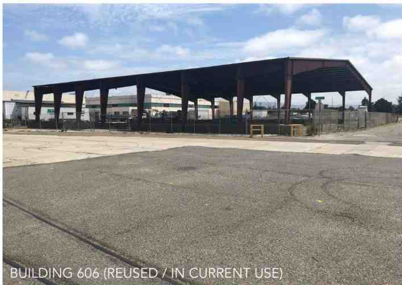
BUILDING 606 (REUSED / IN CURRENT USE)