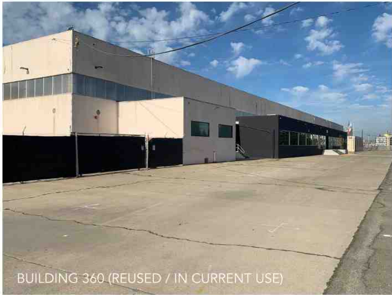
BUILDING 360 (REUSED / IN CURRENT USE)