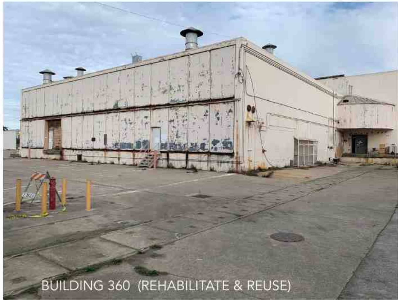
BUILDING 360 (REHABILITATE & REUSE)