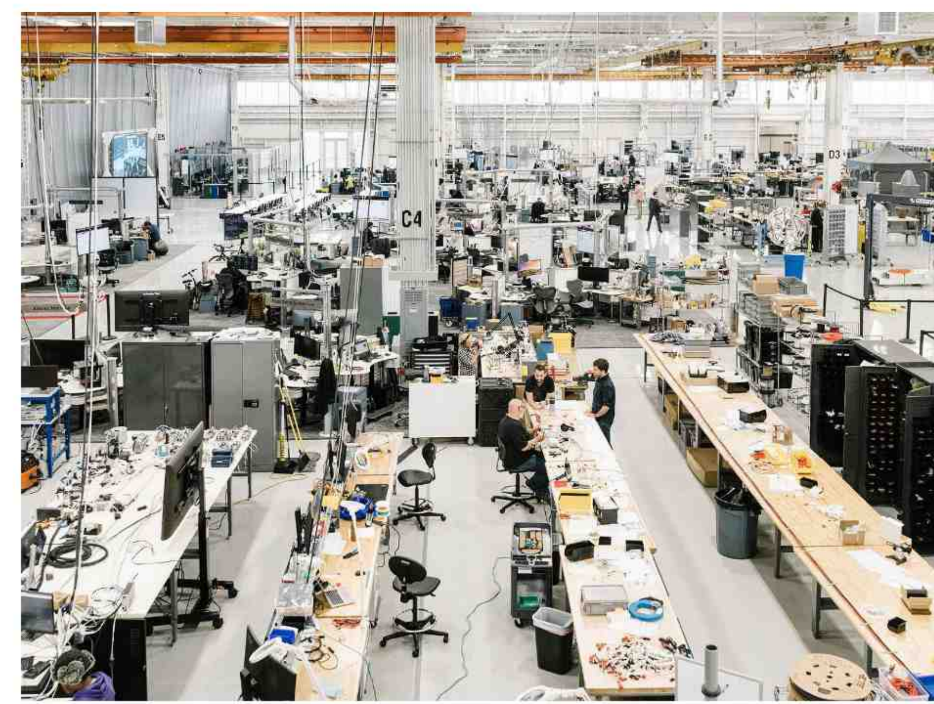
Exhibit 1 Item 7-A, October 11, 2021 Planning Board Meeting