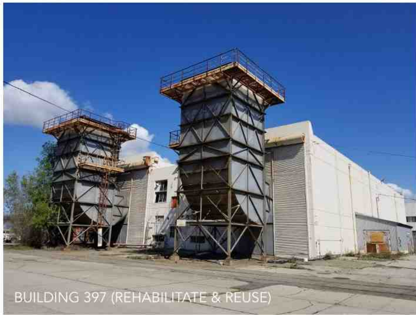
BUILDING 397 (REHABILITATE & REUSE)