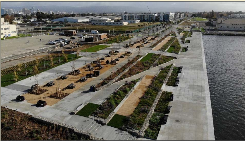
Alameda Point Waterfront Park