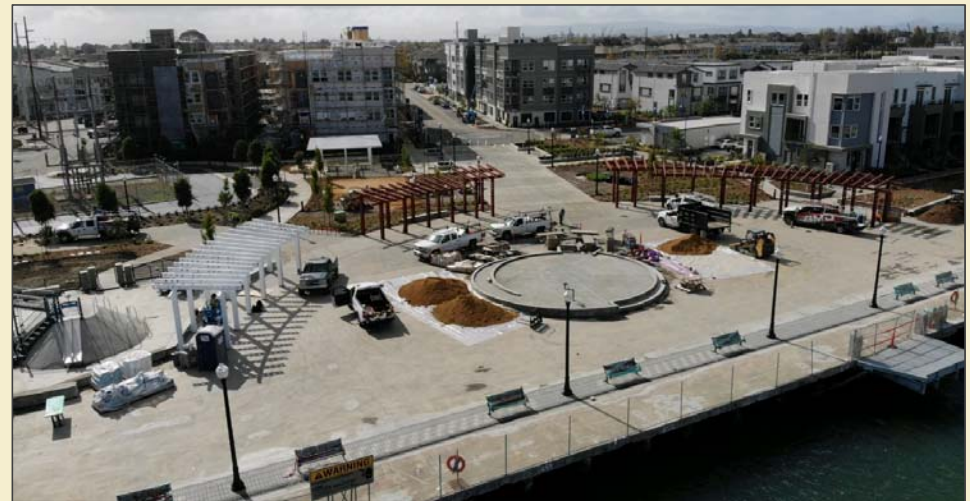
Alameda Landing Waterfront Park