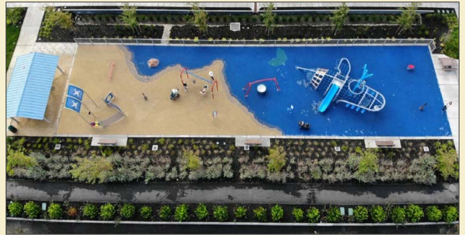
Alameda Point Neighborhood Park