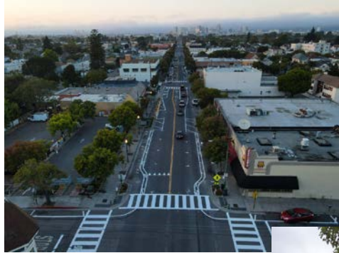
1/ Reconfigured Park and Webster