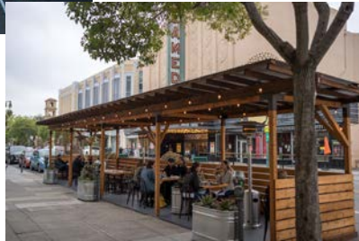
2/ Streamlined Parklet Permits