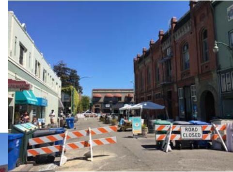
5/ Closed Alameda Ave