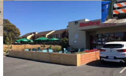
4/ Allowed commercial use in private parking lots