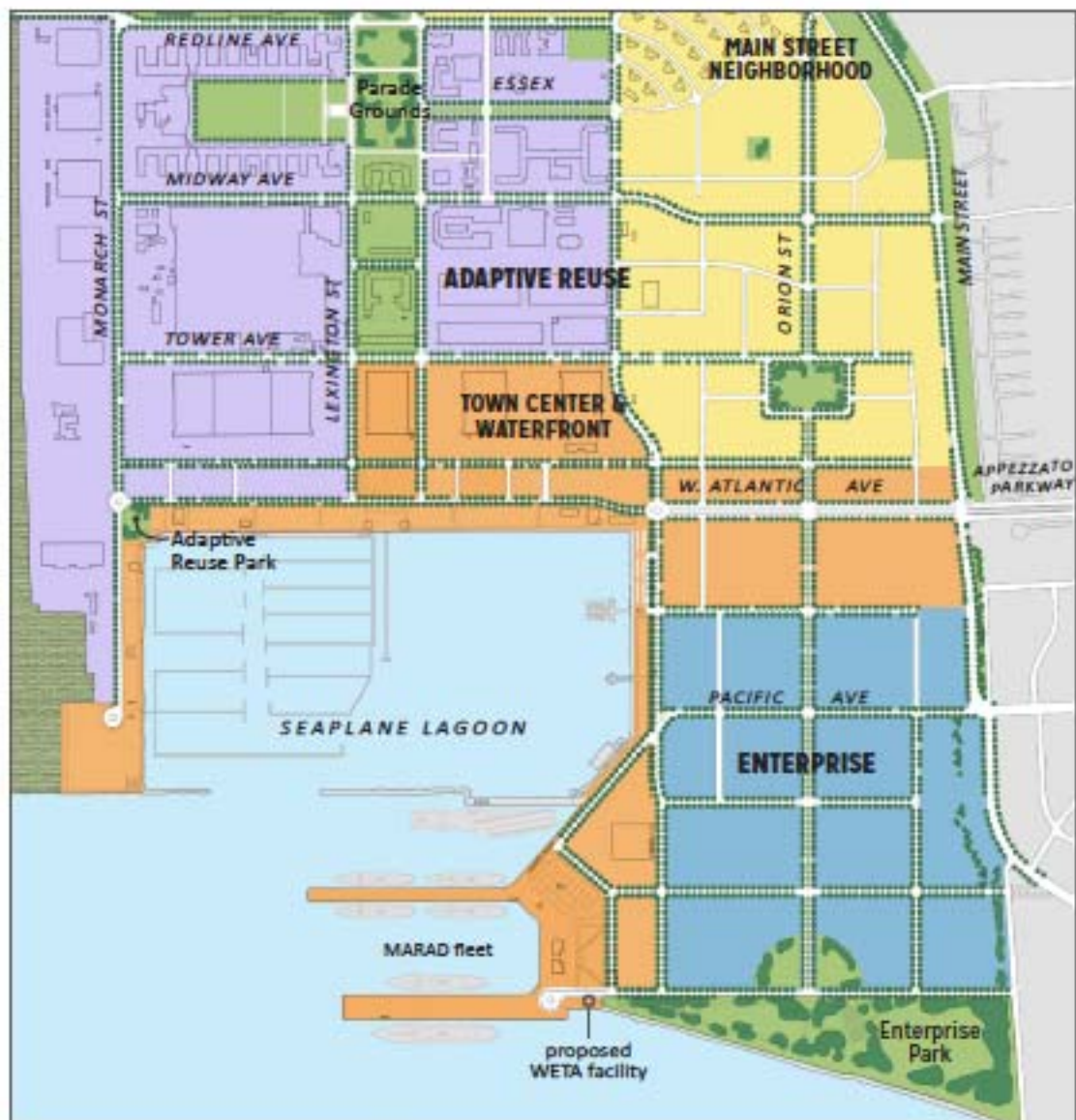
Adaptive Reuse and Enterprise Sub-Area Close-up